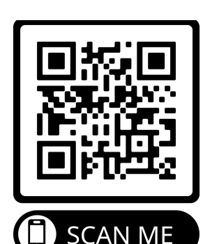
Georgia Christian School @georgiachristian

It's not too late to give! You may give using either of the methods below by scanning the IQD code using a QR Reader or by using the Venmo app, or by going to our website, www.georgiachristian.org, and clicking on Giving and New High School Campaign. We can't wait to hear from you!